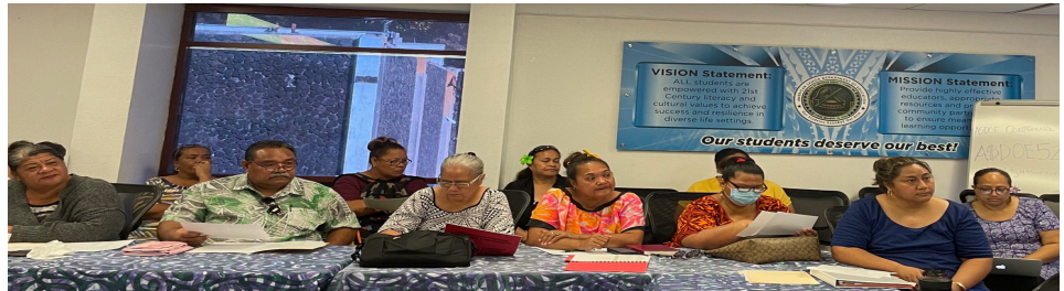
OASIS provides Principals, Counselors and Division ADs an overview of program placement data for SY2023-24

MAY-JUNE: All K-2 teachers compiled end-of-year RW & L4L unit/lesson data to assist with student Program Transition for the new school year. OASIS & ELA worked diligently to review and group for all 23 schools. A tedious and new procedure to ensure students are placed accordingly to their performance level and minimize teacher overload. Fa'afetai lava teachers and supporting areas.