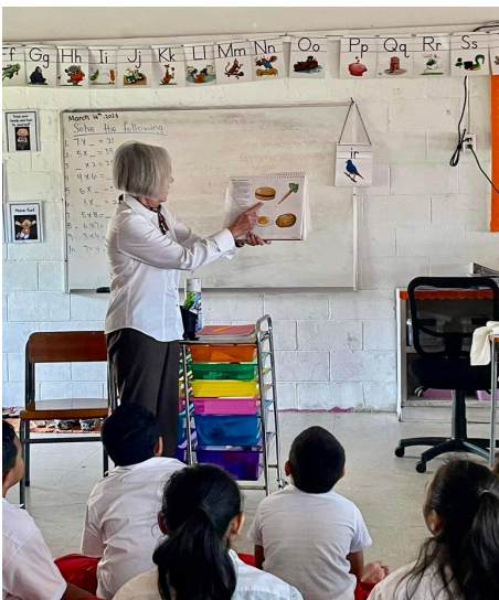
More modeling on effective instruction delivery.