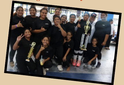
Lutali Elementary School spiked their way to glory at the ASDOE Girls Volleyball Tournament 2024!

Elementary Volleyball Tournament both girls and boys