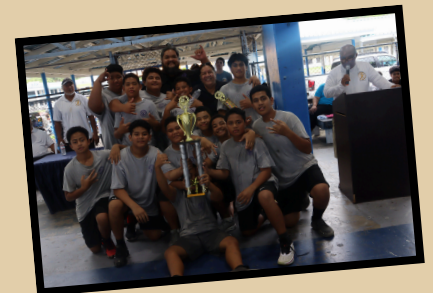
Siliaga Elementary School emerged victorious at the 2024 Boys ASDOE Volleyball Tournament.

Congratulations Champs (A.P. Lutali and Siliaga)