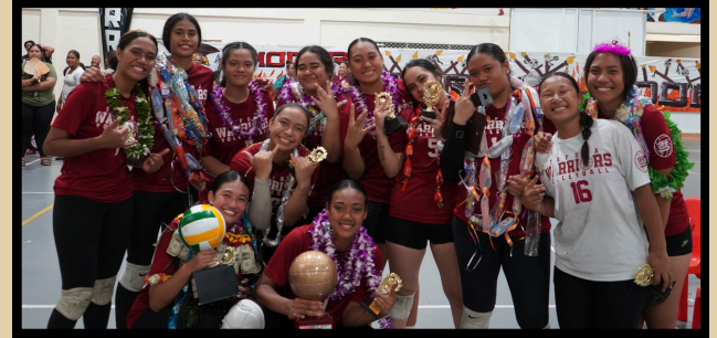
The Tafuna High School Varsity girls triumphed over the Leone High School team in the ASDOE Volleyball tournament 2024

The Tafuna High School Junior Varsity team triumphed in the football tournament, competing against Samoana High School.